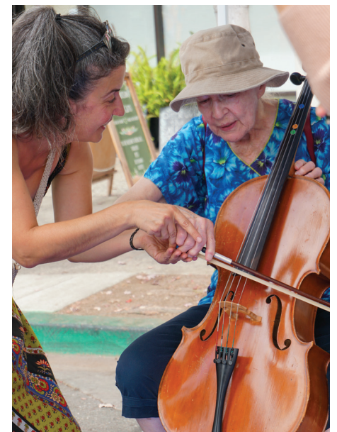
This fall, Crowden students, faculty and staff, and volunteers took our mobile Instrument Petting Zoo to Solano Stroll, a popular local street fair. We helped curious passersby of ALL ages learn to make sounds on our string instruments. At press time, Crowden was preparing its much larger Instrument Petting Zoo for our 23rd annual Community Music Day.